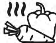
SIDE OF STEAMED VEGETABLES $6.00