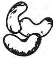
CASHEW NUTS $3.50