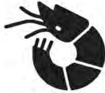
PRAWN $3.00 each