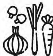
EXTRA VEGETABLES $4.00