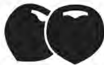
WATER CHESTNUTS $3.00