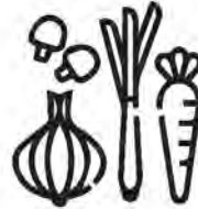
EXTRA VEGETABLES $4.00