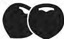
WATER CHESTNUTS $3.00