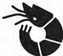
PRAWN $3.00 each