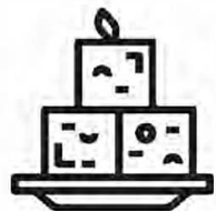
TOFU (4 PIECES) $4.00 each