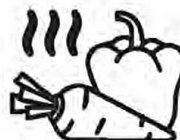
SIDE OF STEAMED VEGETABLES $6.00