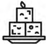
TOFU (4 PIECES) $4.00 each