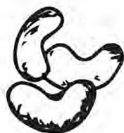
CASHEW NUTS $3.50